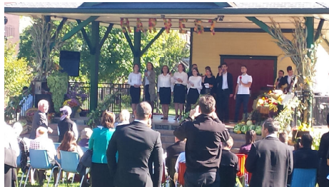
Harvest Sunday at Providence BC in Greenfield (above) & at Slavic Evangelical BC in W. Springfield (below)

Can you believe that we are moving into the 11th month of this year? It is a "leap year" adding an extra to the year. It is an "election year" and this month is the month we remember that God has blessed us and, even in the midst of world-wide chaos, we can and should give Thanksgiving for our God that still has everything under control. I hope you will be praying for our country as we go to the polls next week to elect our next President and then pray for the person who is elected.